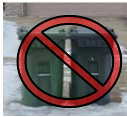
Placed too close together.