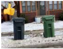
Carts properly spaced 4 feet apart on firm, level surface.